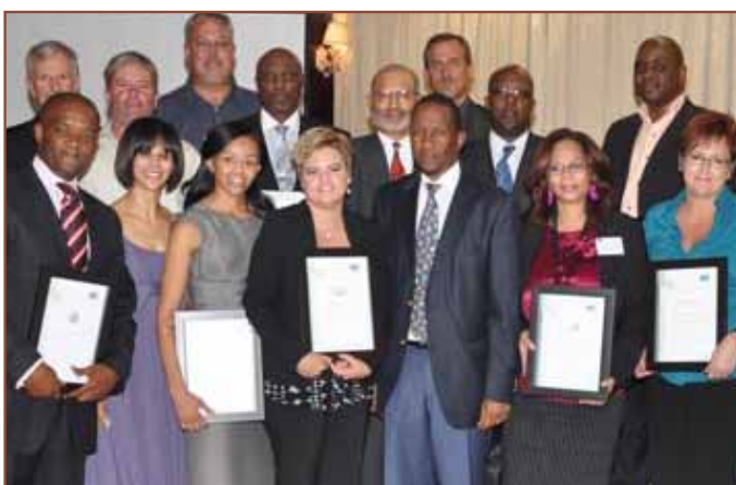
Acknowledgement of Business Support in the Eastern Cape

The support offered through this programme has thus far enhanced the capacity of the 70 senior civil servants by focussing on issues of: