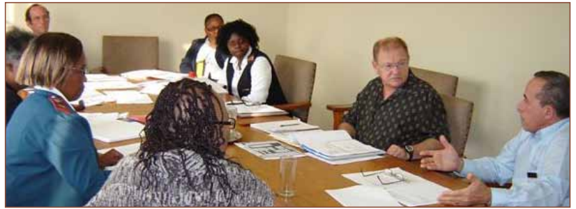
Frontier Hospital Group Meeting