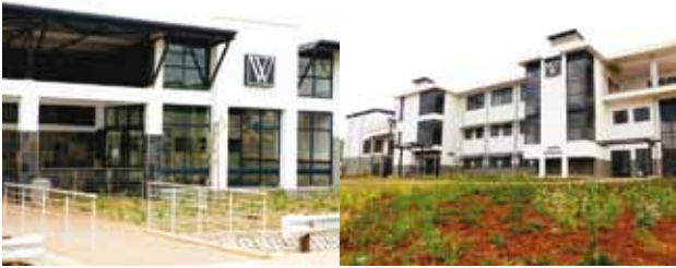
Woolworths Midrand Distribution Centre.

This strategy involves a multifaceted plan that incorporates a series of challenging targets and commitments, centred on four key priorities: accelerating transformation, driving social development, enhancing environmental focus, and addressing climate change.