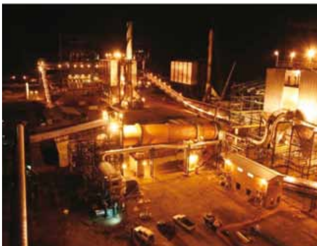
Lion Ferrochrome Plant in Limpopo

An international mining group, Xstrata is committed to achieving energy efficiency at all its operations. This is an approach that is typified by the award-winning programmes it has undertaken at its venture with Merafe in South Africa, where it has achieved a significant saving of more than 12% per tonne of alloy produced.