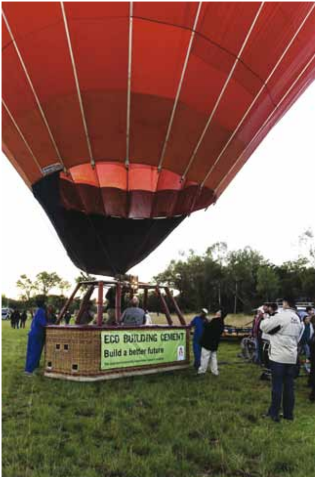
Awareness creation of the Eco Building Cement

It has been shown that bucket elevators draw on average 0,41kWh/t of material, while air lifts draw 1,10kWh/t of raw material (World Cement, 2004). The 2003-2004 upgrade of the Duffield 3 raw meal elevator and the subsequent 2006 upgrade of the Duffield 2 elevator from air lifts to bucket elevators therefore resulted in a 62% reduction of electrical energy use.