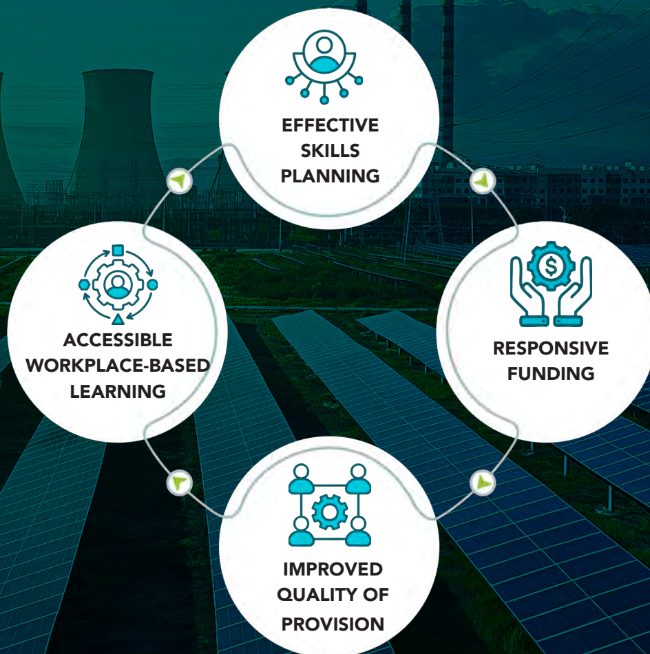
Figure 2 | Key levers for systems change

These four are further combined into two integrated levers, being: