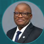
Lungisa Fuzile CEO: Standard Bank South Africa